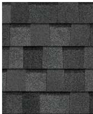
Estate Gray +