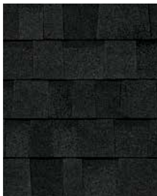
Onyx Black +