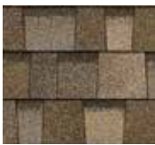
Sand Dune 1 Not available in Service Area 1