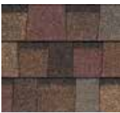
Summer Harvest 1 Not available in Service Area 1