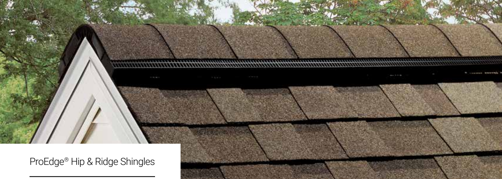
ProEdge® Hip & Ridge Shingles