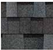
Pacific Wave 1