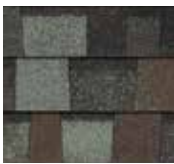
Storm Cloud 1 Not available in Service Area 1