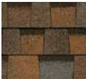
Aged Copper 1 Not available in Service Area 1

ProEdge® Hip & Ridge shingles coordinate with TruDefinition® Duration® Shingles Designer Colours Collection.