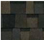
Black Sable 1