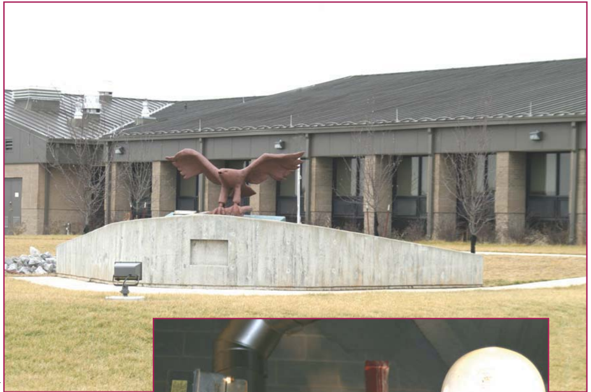
Fort Campbell, KY