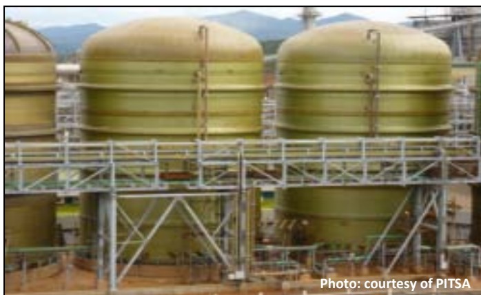
Figure 3 Large-diameter Advantex® Glass FRP tanks used for storing hydrochloric acid provides superior corrosion resistance

Despite the corrosion industry’s propensity for using high-cost metal alloys with various coating technologies to extend the life of metallic structures in highly corrosive environments, Advantex® glass reinforced FRP materials serve as a higher performing alternative to expensive metal alloys. These Advantex® glass FRP materials provide lightweight (seven times lighter than CS), superior corrosion performance (of years to days/weeks with E-Glass-FRP/metals), and design flexibility for producing both large- and small- scale structures (figure 3). And, unlike structures made with metal alloys, those made with FRP materials with Advantex® glass do not require coating or painting resulting in savings in the overall project cost (direct and indirect costs).