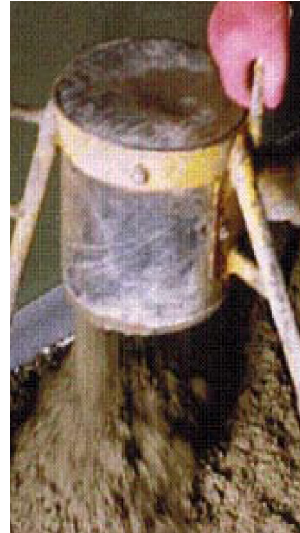
The mix is perfectly workable, easy to be pumped and leveled. No fiber on surface

ANTI-CRAK® FIBERS ARE PART OF THE CEM-FIL® PRODUCT RANGE