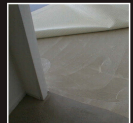
Perfect finished surface